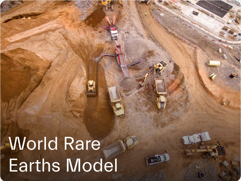
World Rare Earths Model