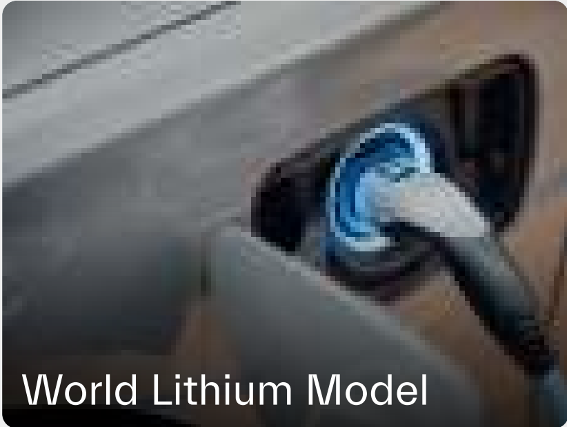
World Lithium Model