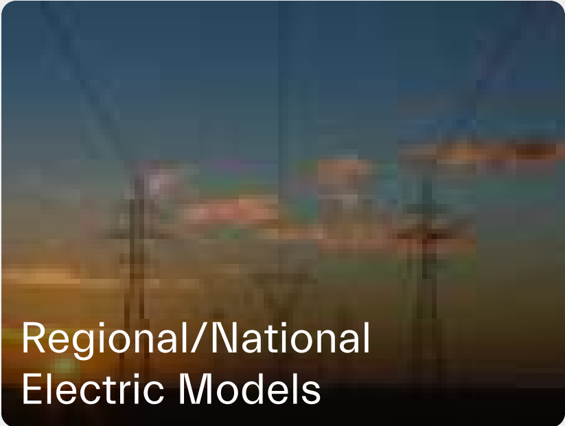
Regional/National Electric Models